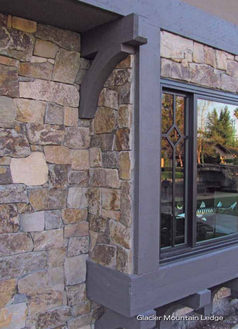
Glacier Mountain Ledge