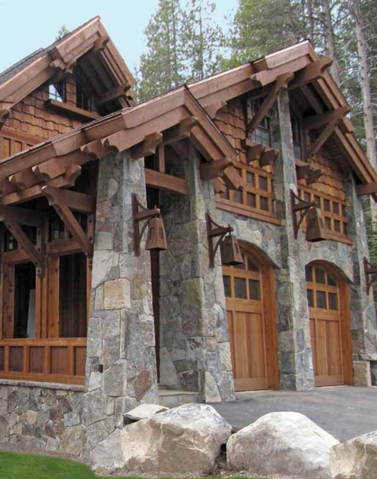
Canyon Creek 3-5" Random (Rocky Mountain Gold photo not available at this time)