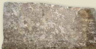
LEDGESTONE Length: 6" to 16"+ Height: 1" to 8" Thickness: .5" to 1.5"

Natural Lite™ Thin Veneer (NLTV) is a lightweight alternative to full stone and a higher quality alternative to manufactured stone. Our natural stone, both full stone and thin veneer, is available in the following shapes; Ledge, Random / Mosaic, Squares & Rectangles as well as custom cuts.