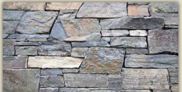
LOON LAKE LEDGE*

Loon Lake comes in a wide array of colors including blues, greens, bronze, browns, tans and slate grays with subtle sedimentary striations. Available in Natural Lite™ Thin Veneer and Full Stone.