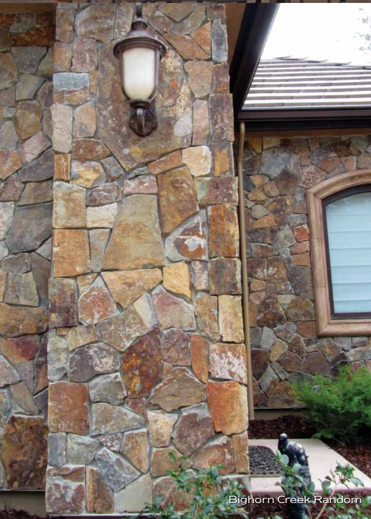
Bighorn Creek Random