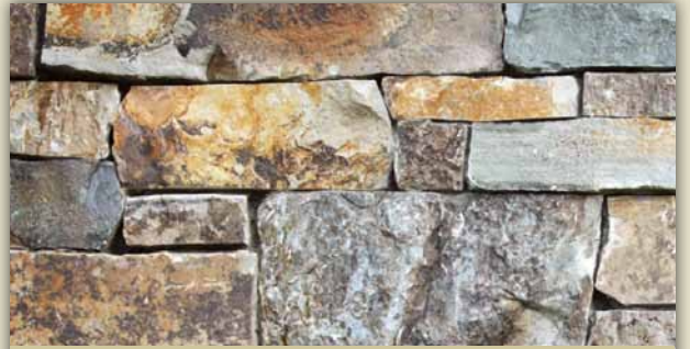
GLACIER MOUNTAIN LEDGE

This family of stone has a cream base with hues of gold, black and light grays running throughout. This stone features a unique dendrite fern pattern. Available in Natural Lite™ Thin Veneer and Full Stone.