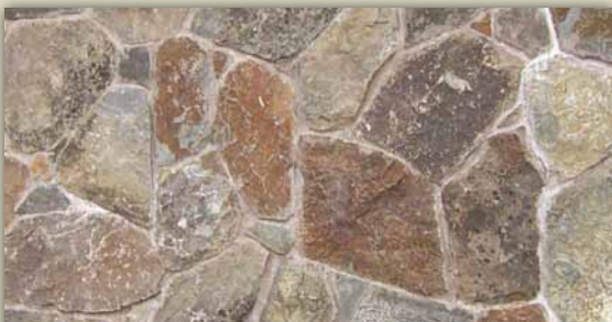
VE BITTERROOT RANDOM VENEER

Random Thin Veneer provides more of the Tuscan or Fieldstone look featuring the same beauty and colors in a more affordable shape. Available in Bighorn, Bitterroot, Canyon Creek, Glacier Mountain and Loon Lake.