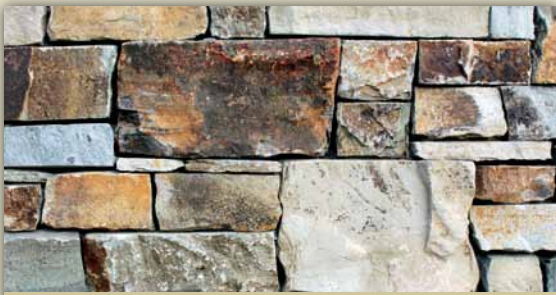
VE BITTERROOT LEDGE

*See individual pages for color descriptions.