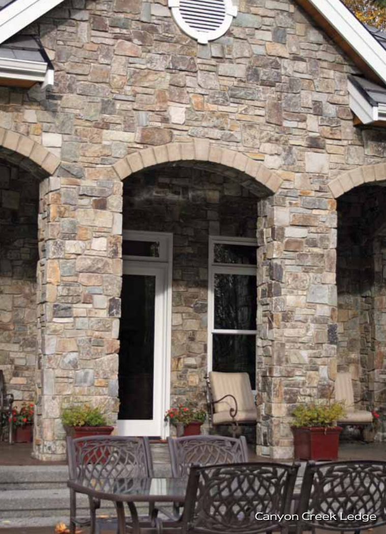
Canyon Creek Ledge