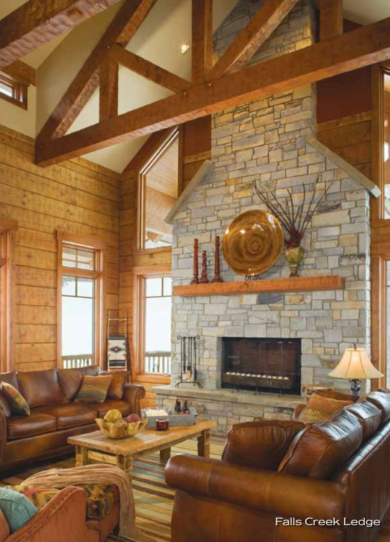
Falls Creek Ledge