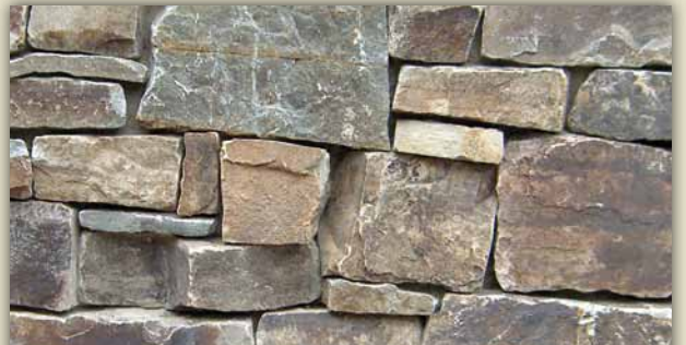
CANYON CREEK LEDGE

The Canyon Creek family is one of our most popular stones featuring rich colors ranging from chocolate brown, tans, and blue/gray tones — true to the Northern Rockies. Available in Natural Lite™ Thin Veneer and Full Stone.