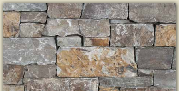
ROCKY MOUNTAIN GOLD LEDGE

This is an exceptional building stone offering the beautiful warm color blend variety of browns, gold tones, bronze, tans and grays. This stone also features a unique dendrite fern pattern creating an additional signature look that will enhance the beauty of any project. Available in Natural Lite™ & Full Stone.