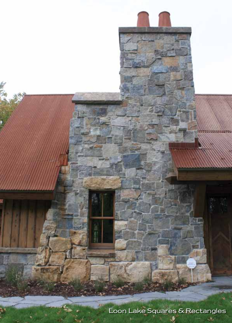
Loon Lake Squares & Rectangles