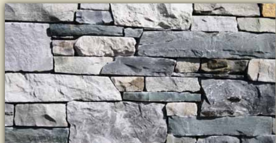
VE STILLWATER BLEND

Our VE Stillwater Blend is a very affordable natural split face stone featuring more of a neutral color palette blending well with any architecture. The split faces add character and provide a new unique look. This product is a great LEED solution.