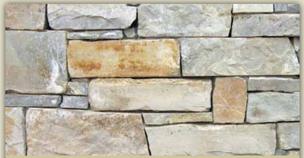
FALLS CREEK LEDGE

Falls Creek is a lighter toned product ranging from light tan to gold with occasional buff hues accenting the soft, warm textures. Available in Natural Lite™ Thin Veneer and Full Stone.