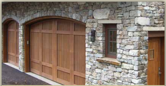
VE CANYON CREEK TUMBLED LEDGE

*See individual pages for color descriptions.