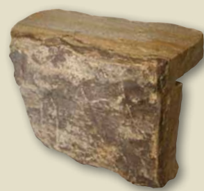
CORNERS Length: 2" to 10" Height: 1" to 8" Thickness: .5" to 1.5"

SPECIALIZING IN THE REVOLUTIONARY NATURAL LITE™ THIN VENEER