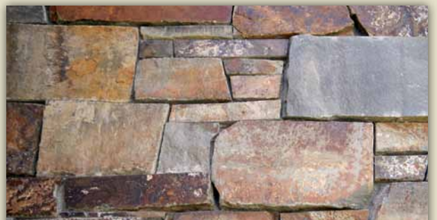
BIGHORN CREEK LEDGE

Bighorn Creek has a wide range of rich multi-colored hues of rust, bronze and copper created from the stone's iron content. Its core is a blue gray. Available in Natural Lite™ Thin Veneer and Full Stone.